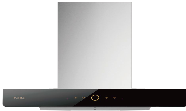
With Decorative Cover